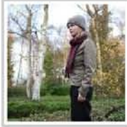
Outfit 26/11/12 – Beanie woman.