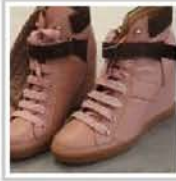
April 27, 2012