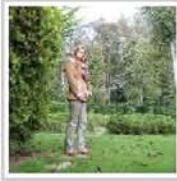
Outfit 10/10/11 – Kirilove